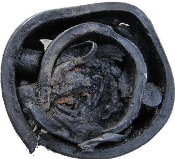
Premature bearing failure due to lubrication and contamination problem